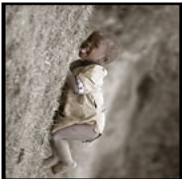
Young Spirit Usambara Mountains, Tanzania Exhibited size 50x50cm Exposure 1/160s at f/6.3