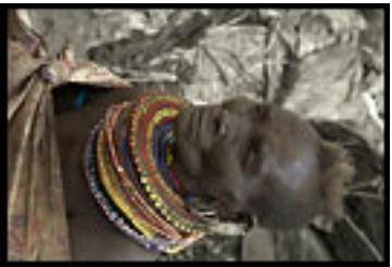
Turkana Elderly Woman Village north of Maralal, Northern Kenya Exhibited size 30x40cm Exposure 1/60s at f/4.5, polarizing filter