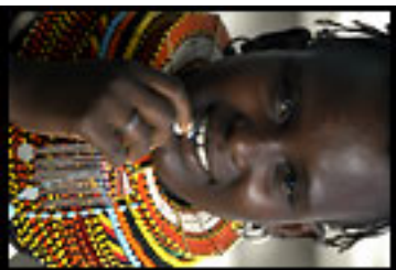
Turkana Princess Suguta Valley, Northern Kenya Exhibited size 50x70cm Exposure 1/80s at f/4.5