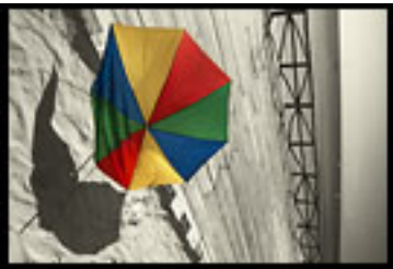
Umbrella On A Beach Northern Zanzibar, Tanzania Exhibited size 50x70cm Exposure 1/30s at f/16