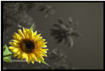
Exotic Sunflower Central Zanzibar, Tanzania Exhibited size 30x40cm Exposure 1/320s at f/4, polarizing filter