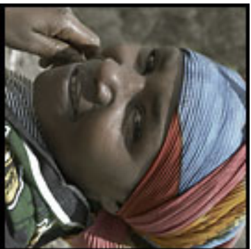
Shambara Woman Usambara Mountains, Tanzania Exhibited size 50x50cm Exposure 1/80s at f/11